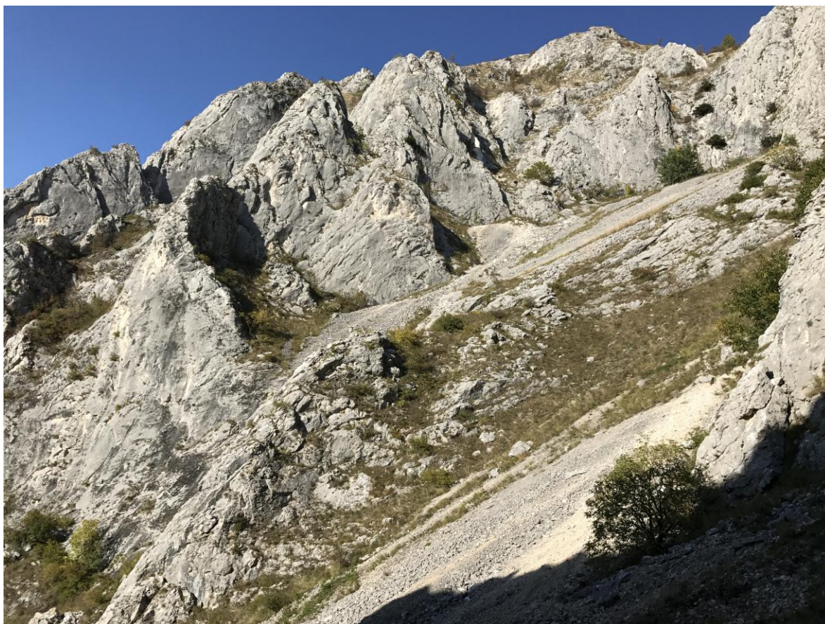
Piatra Secuiului Mountains near Torok Town, Romania.

A typical cliff system can be structurally divided into three distinct zones, each characterised by unique microenvironmental conditions and vegetation assemblages. Firstly, the cliff edge refers to the plateau or plain situated above the cliff face. This area is generally marked by thin, dry soils and supports stunted woodland or xerophilous grassland vegetation. Plant communities here are typically dominated by drought-adapted species, including winter annuals, mosses, lichens, and other specialists tolerant of xeric conditions. Secondly, the pediment denotes the rock base at the foot of the cliff. This zone provides a more favourable environment for plant growth due to enhanced access to water and oscillating microclimates—from warmer, sun-exposed sites to cooler, shaded niches. The pediment frequently hosts talus communities, which develop on the debris accumulated at the base, offering substrates for a variety of species. Thirdly, the cliff face itself forms the steep, near-vertical expanse of exposed rock between the upper edge and the lower pediment. Soil accumulation is minimal in this challenging environment, and vegetation consists predominantly of long-lived perennials such as certain trees, shrubs, vines, and ferns that are specially adapted to persist in extreme conditions (Larson et al., 2000; Bogges et al., 2017).